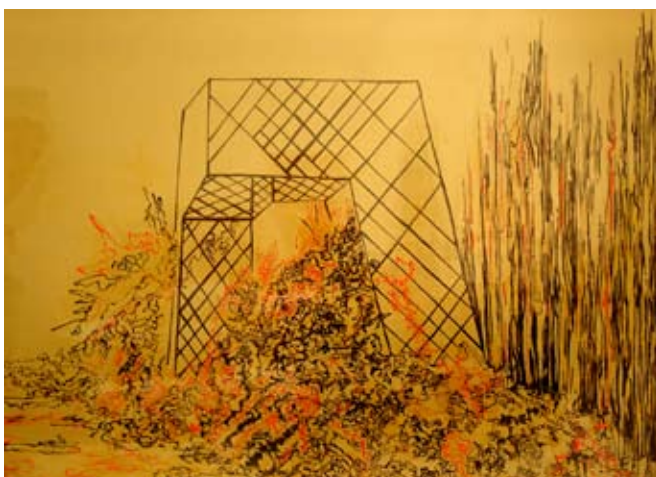
Fiery Tower #1 , painted and fired glass