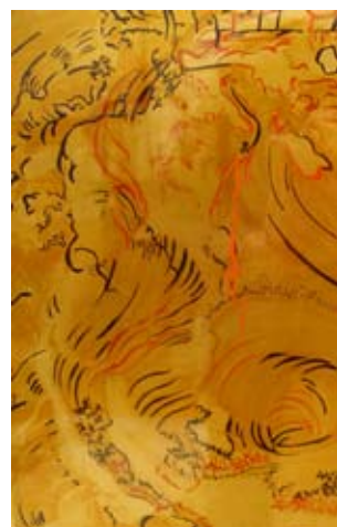
Detail of Blazing Construction #2 Painted and fired glass.