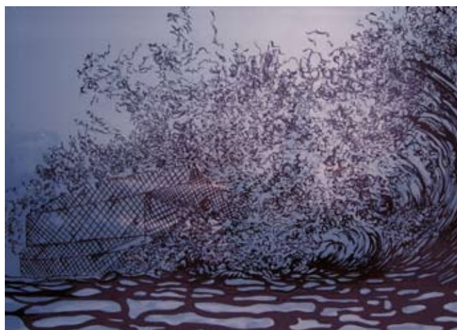
Deluge #1 , painted and fired glass in acrylic holder